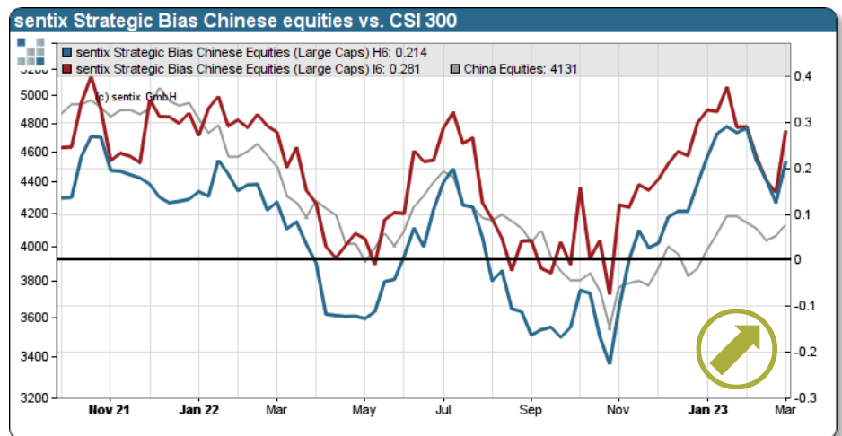
sentix Strategic Bias Chinese equities (Headline, Institutional) and CSI 300

Things are looking good for the Chinese stock market: The strategic bias is rising significantly again and ending its breather. This can be observed even more strongly among investment professionals. This is in clear contrast to the bias development for the other equity markets, which all reflect weak underlying confidence - despite rising/stable equity prices. In the case of bonds, the contrarian signals are increasing. High pessimism is accompanied by high overconfidence.